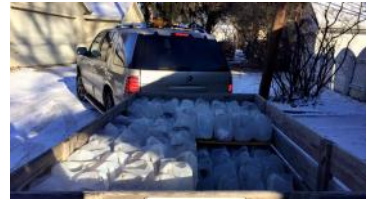
Volunteers load hundreds of luminaries on a trailer, destination Auburn St. Bridge!

Enjoy and participate in an Edgewater tradition: Luminaria Night! Line your walkways with luminaries (white candle-lit bags weighted with sand) at dusk on Saturday, December 16. If you plan to host a holiday party this is a great night to do it! Volunteers will set up and light hundreds of luminaries in common areas such as the Auburn Street Bridge; want to help? Call John Beck at 815.289.4787.