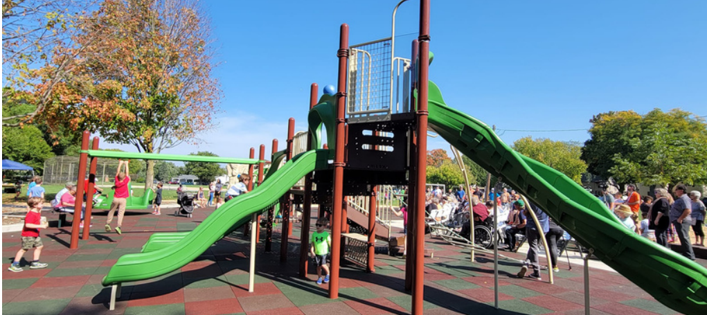
Continued on Page 7